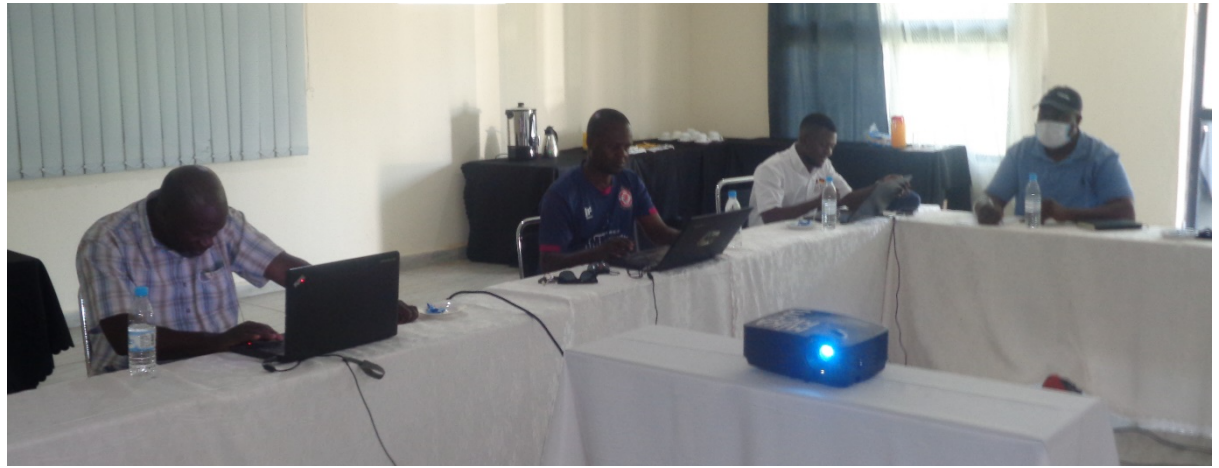
The Team in the workshop room.

By the end of day five, the team had achieved the set objectives. The curriculum and job profiles for Agricultural Mechanic Technicians were successively developed and submitted to TEVETA for a final review before it is adopted as a course, to be trained in Technical Colleges and Trade Schools. The names of the team will feature in the acknowledgement page of the final curriculum documents.